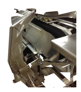
Open design ensures all contact surfaces can be sanitized