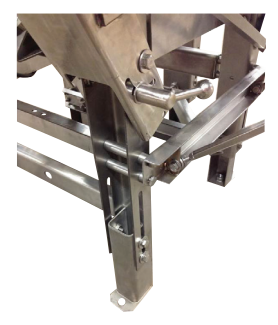
Standoffs used to minimize overlapping joints for full access while cleaning