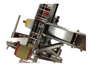
Angled surfaces maximize water shedding

Quick release drive belts can be removed and replaced in a matter of seconds, not minutes.